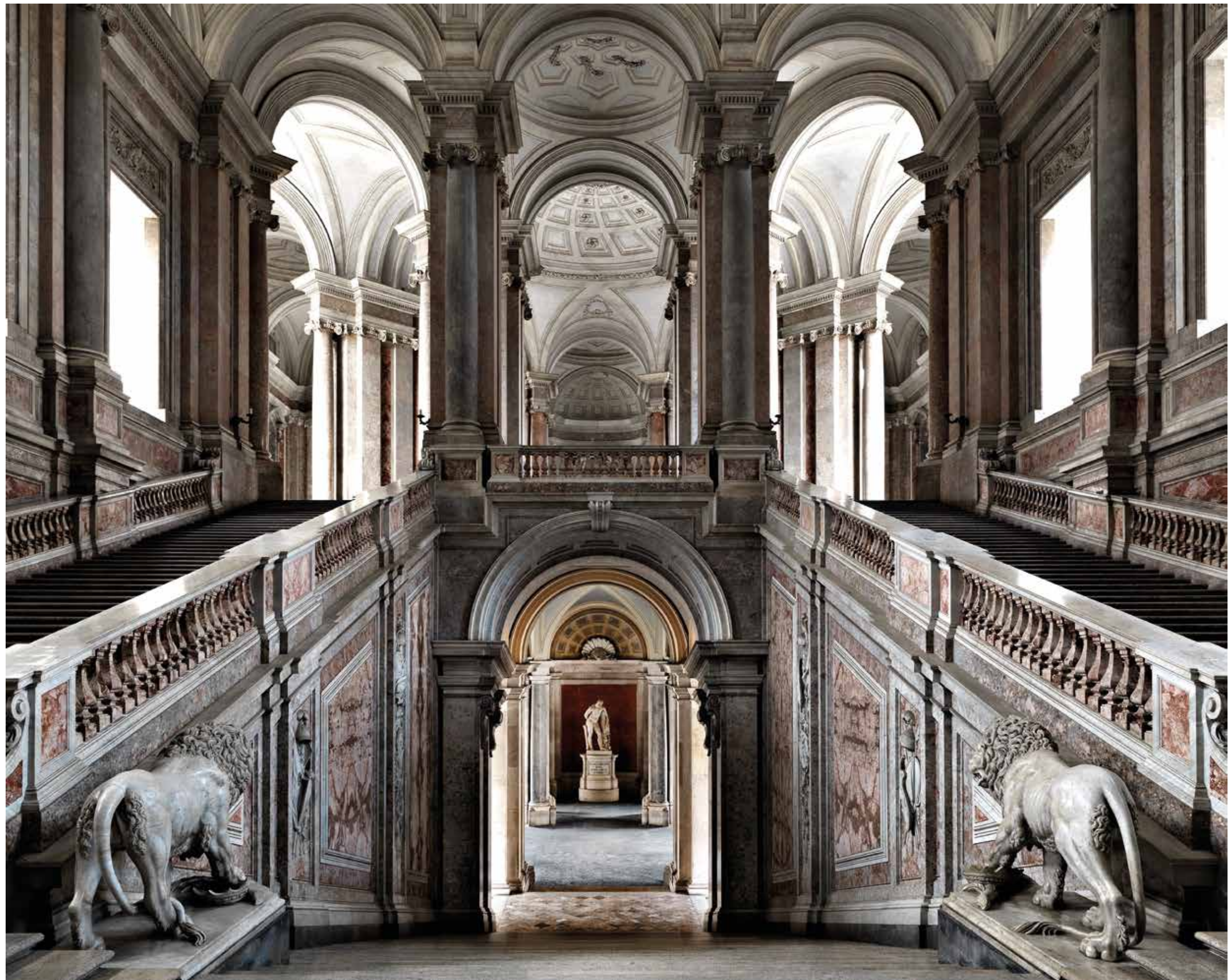
Reggia di Caserta IV - Italia 1993 Grand Staircase of Honour, by Massimo Listri