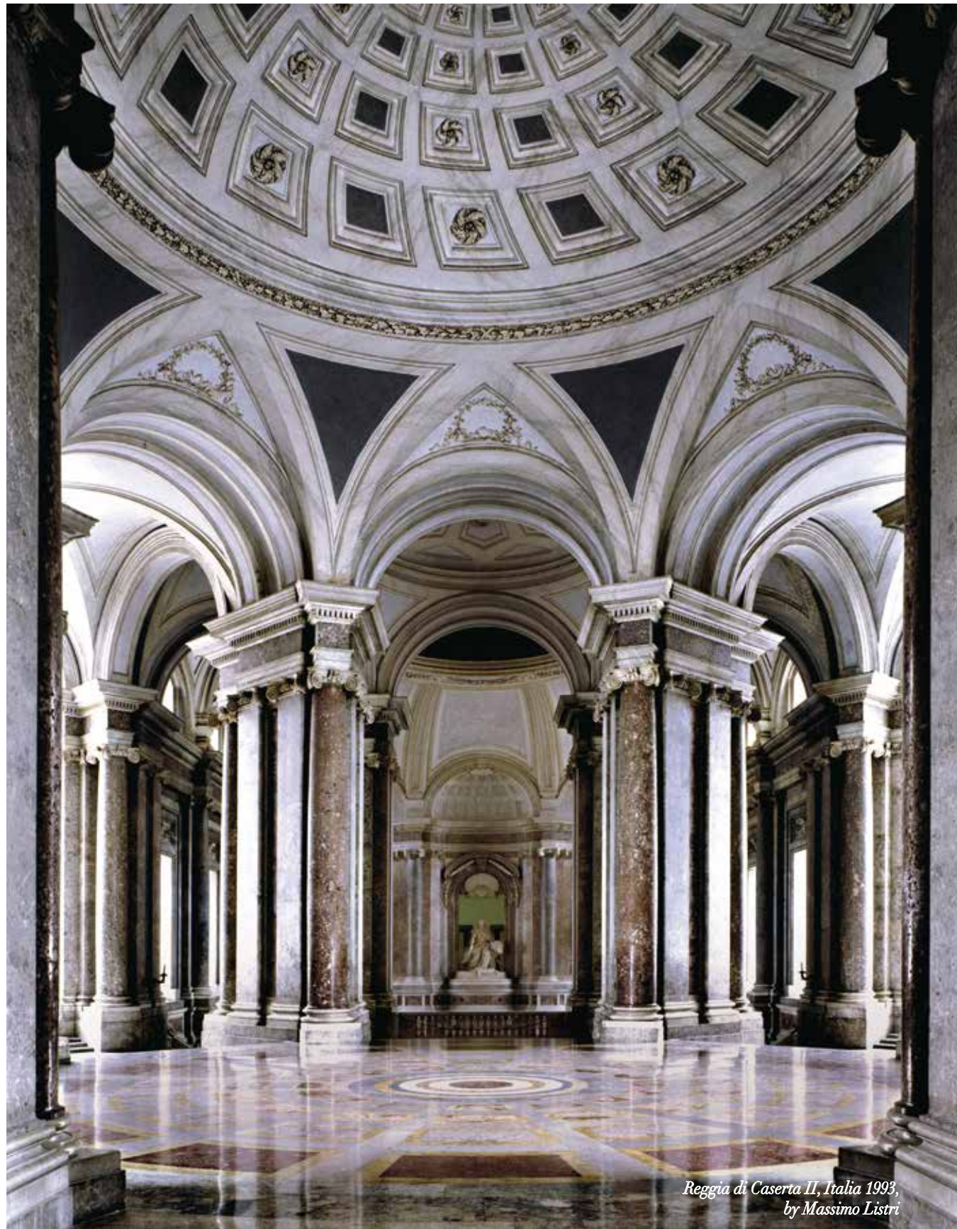
Reggia di Caserta II, Italia 1993, by Massimo Listri