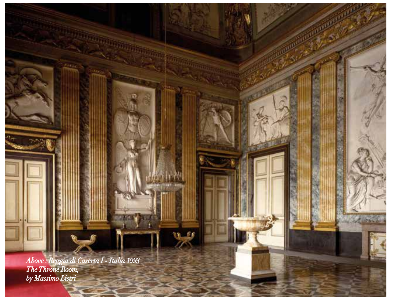
Above : Reggia di Caserta I - Italia 1993 The Throne Room, by Massimo Listri