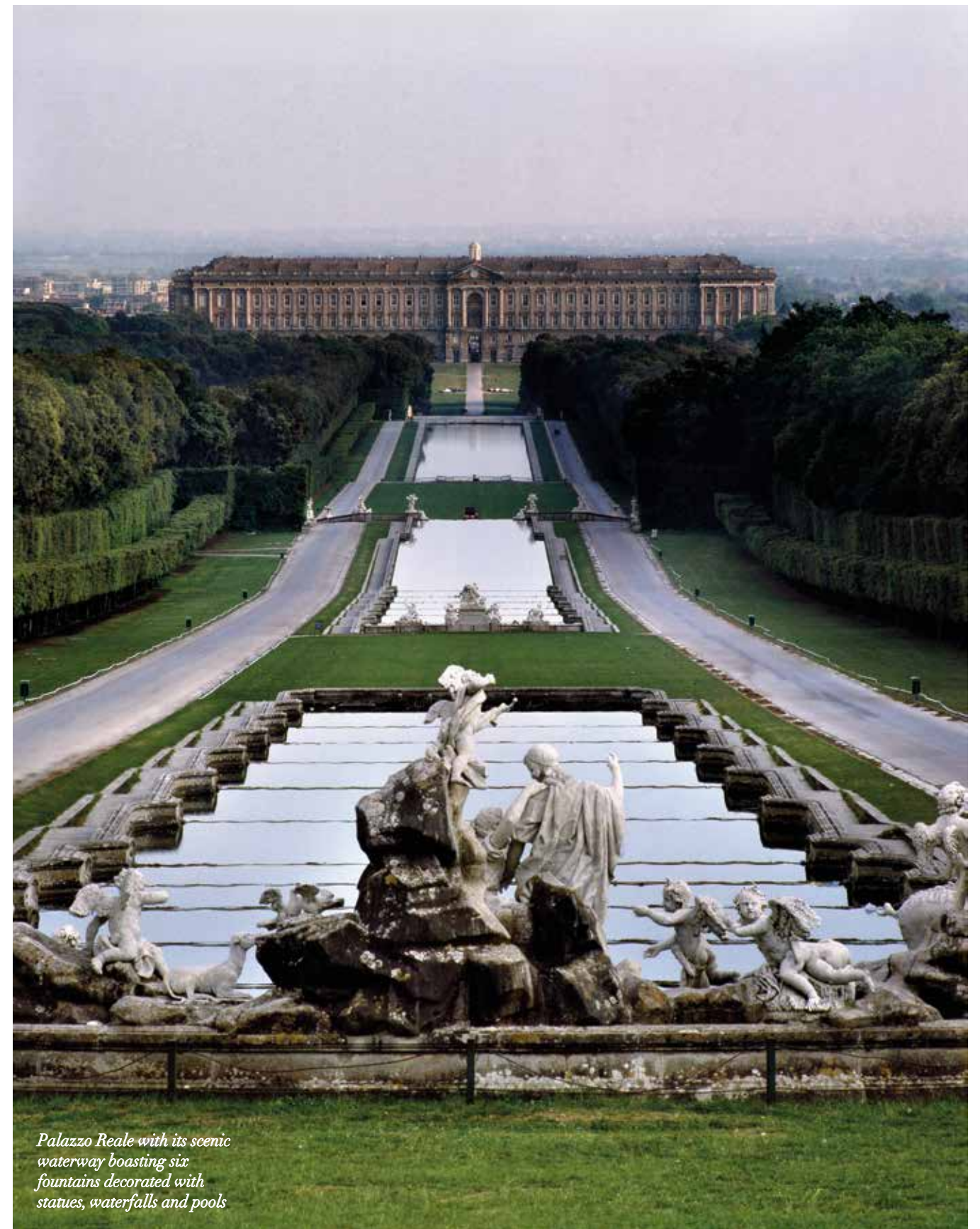
Palazzo Reale with its scenic waterway boasting six fountains decorated with statues, waterfalls and pools